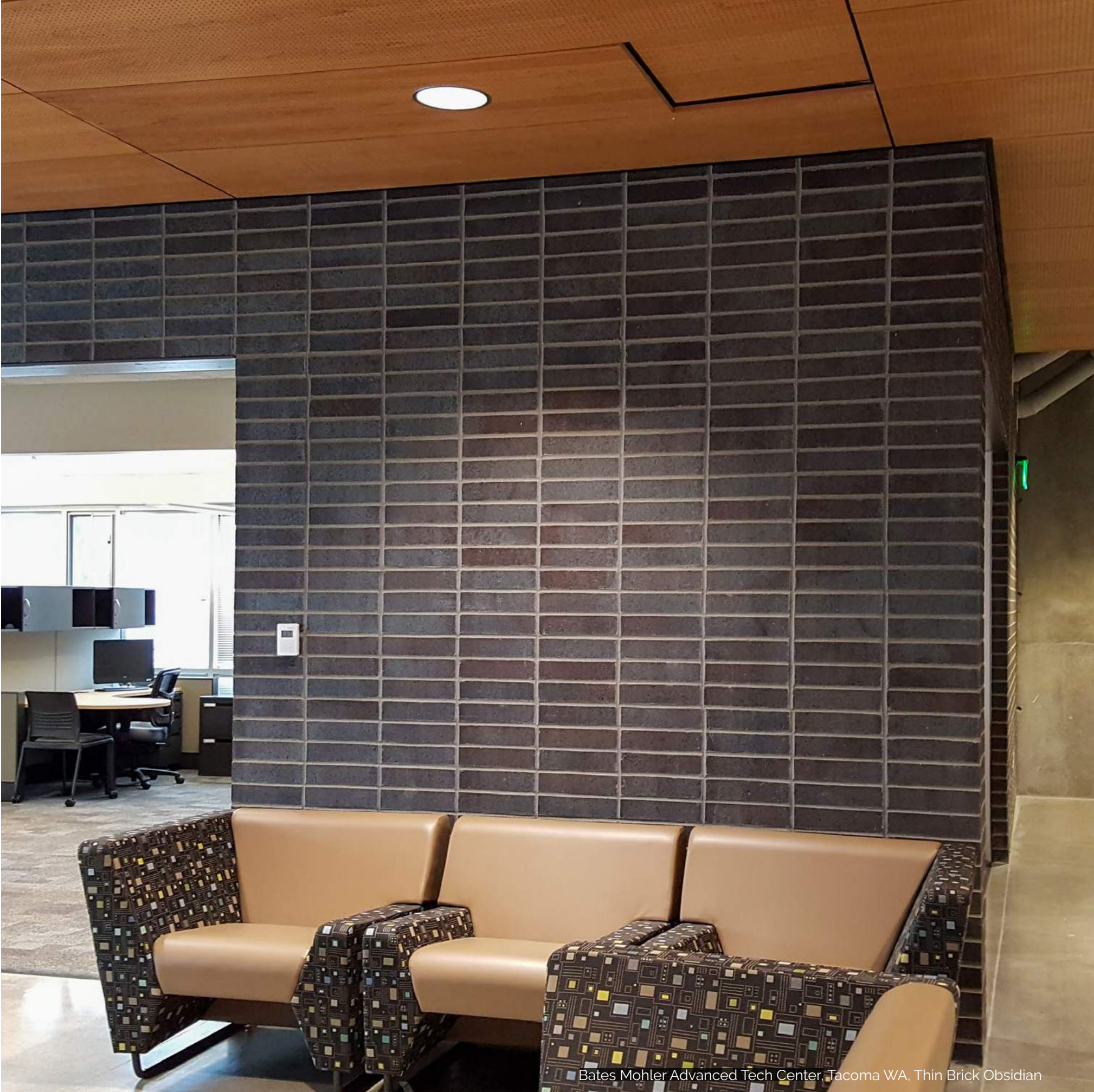
Bates Mohler Advanced Tech Center, Tacoma WA, Thin Brick Obsidian

More Sizes , More Shapes , More Possibilities