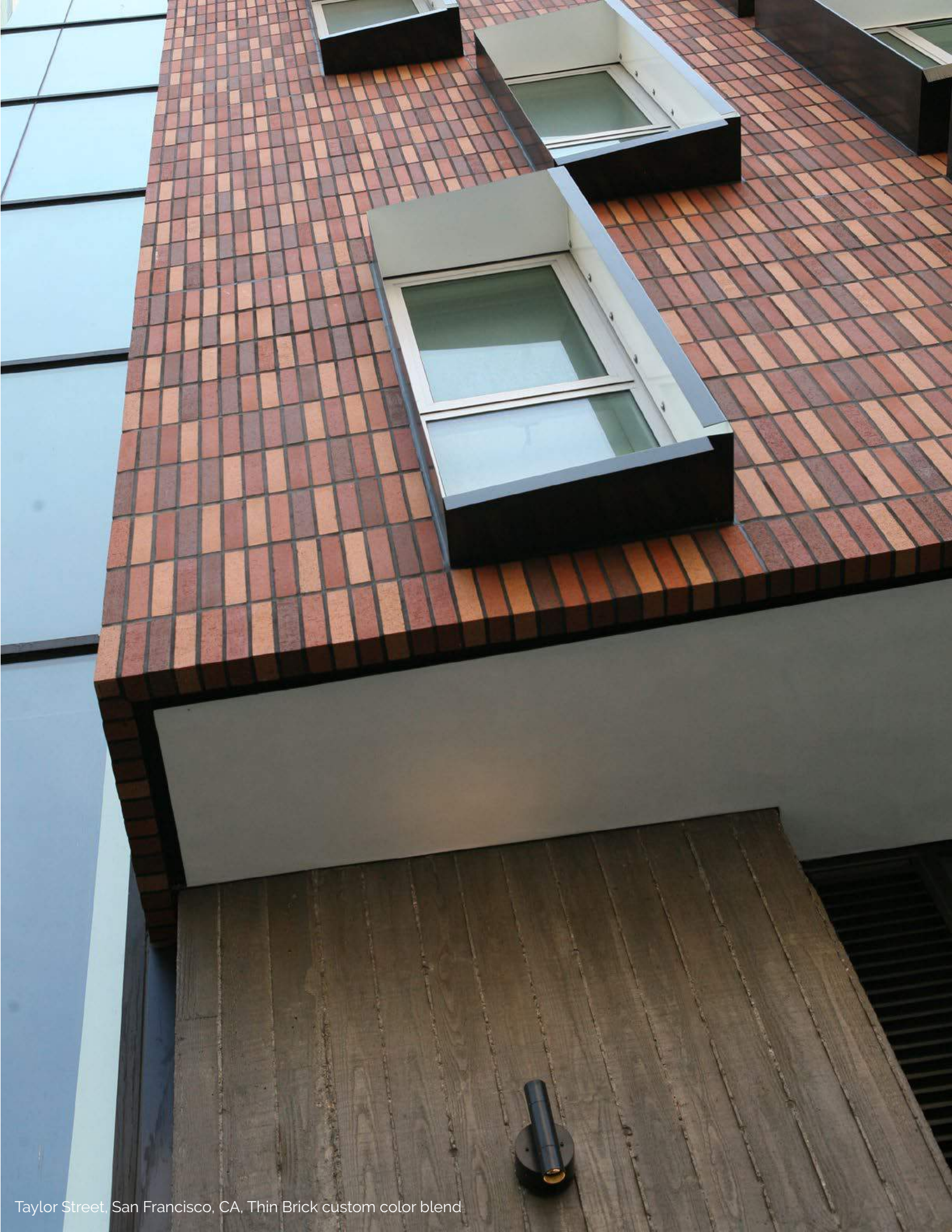
Taylor Street, San Francisco, CA, Thin Brick custom color blend