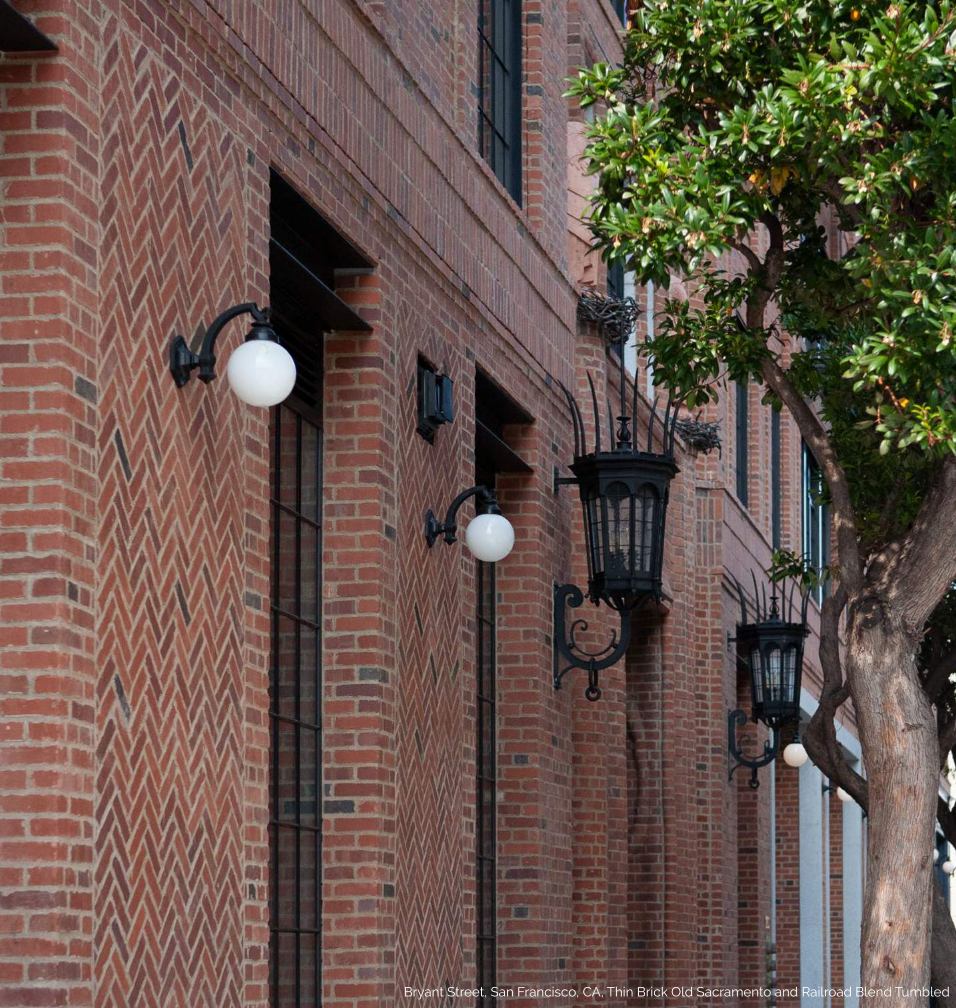
Bryant Street, San Francisco, CA, Thin Brick Old Sacramento and Railroad Blend Tumbled