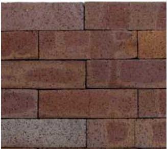
Monterey Bay Flashed (Cross Set)