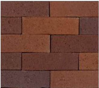
Old Town Red