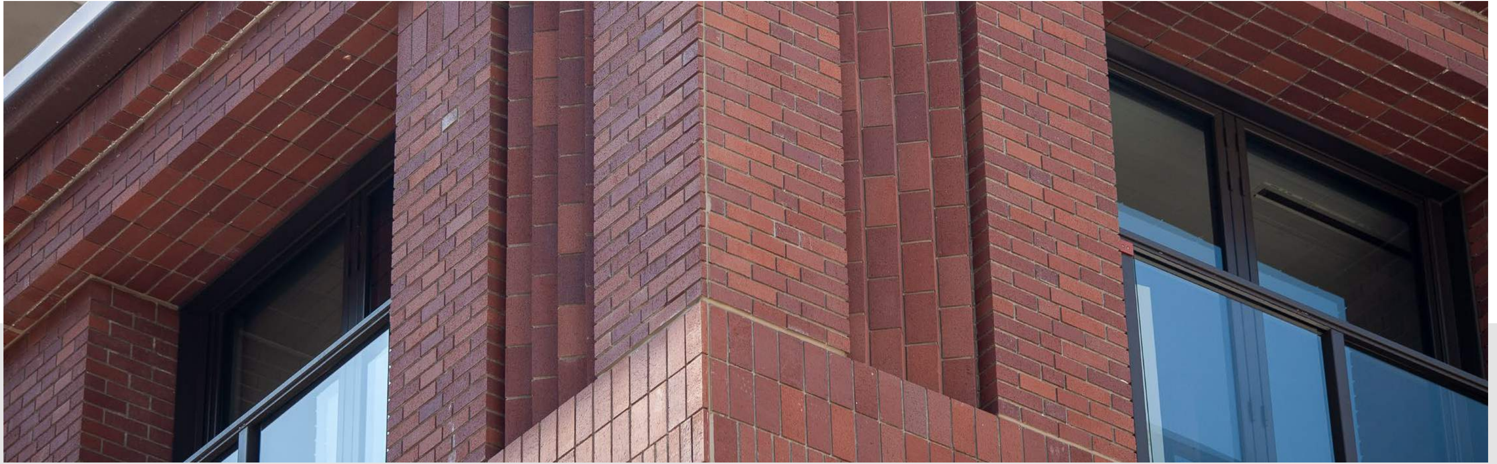
Hamilton Street, Redwood City, CA, Thin Brick Old Town Red and Mountain Rose