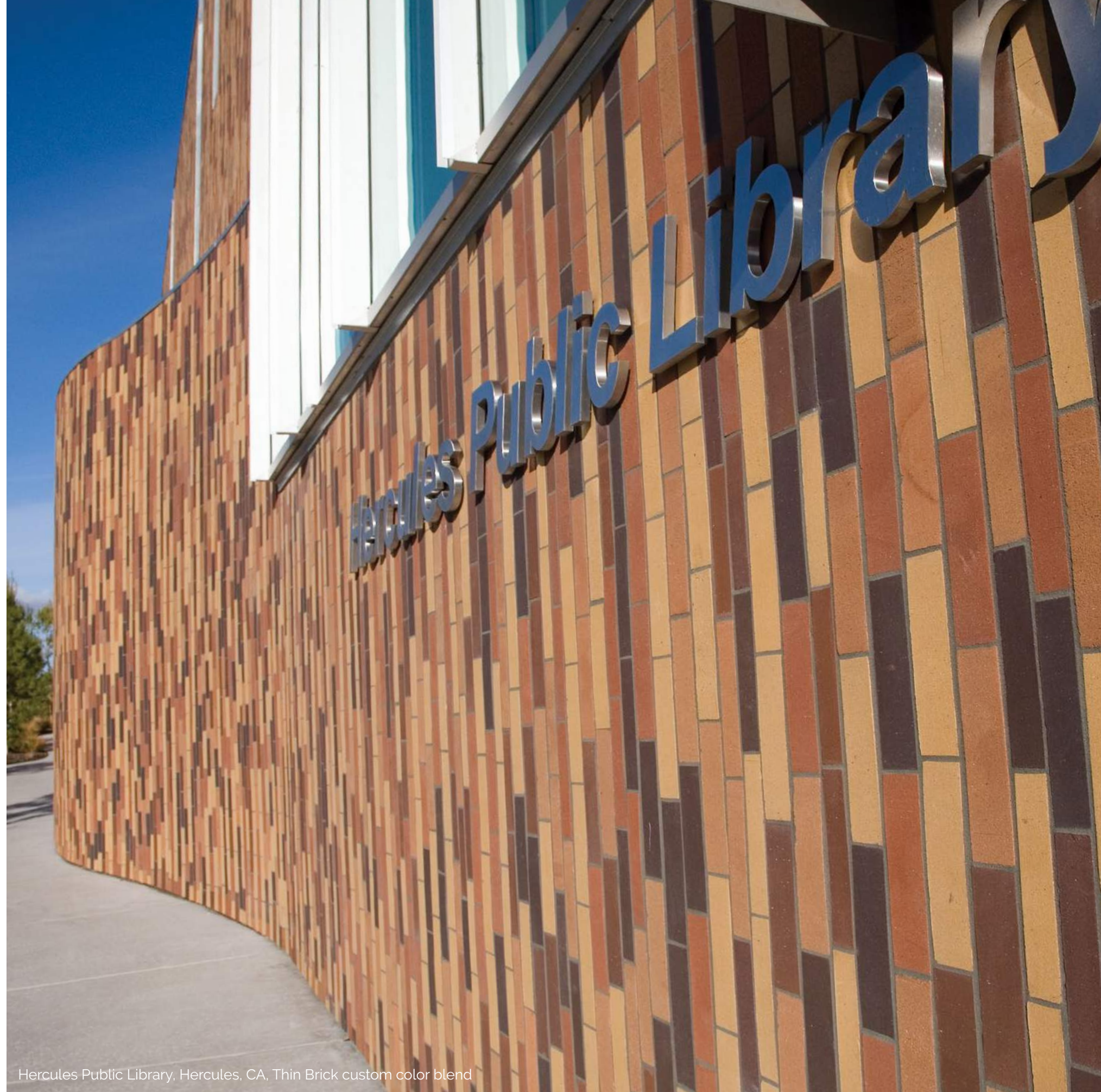
Hercules Public Library, Hercules, CA, Thin Brick custom color blend